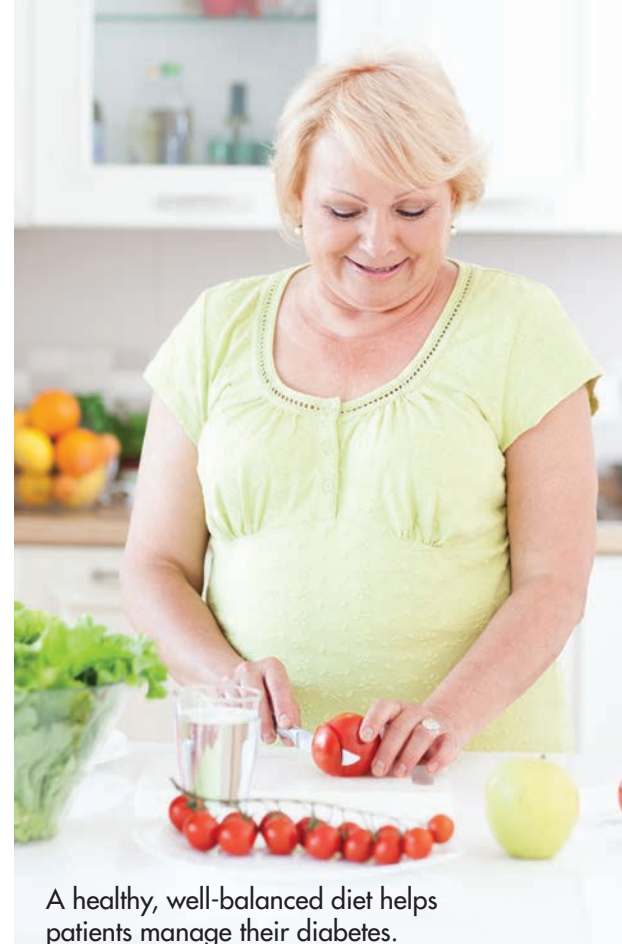
A healthy, well-balanced diet helps patients manage their diabetes.